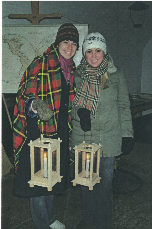
Cultural Arts Administration Class Trip

DO YOU WANT TO MAKE A DIFFERENCE IN SOCIETY? Are you curious about why people do what they do? Have you been a leader in your school? Are you active in your community? Have you volunteered to help someone? Do you value the part that leisure plays in your life? Are you concerned about the environment? If you said “yes” to any of these questions, you should think about applying to the Bachelor of Recreation Management (BRM) program at Acadia University. We welcome students who have a keen interest in helping to improve conditions in the world—improving individual lifestyles; improving community and environmental health; improving the lives of people with disadvantages. We value diversity, social justice and environmental sustainability.