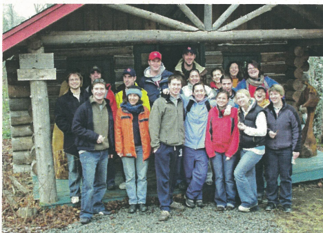
Leisure Education Class Trip

Outside the classroom our faculty continue to be involved with our students as teachers and mentors, working with them in COMMUNITY ENGAGEMENT programs, practicums, and research projects, such as providing leisure education to youth-at-risk, leading outdoor environmental education with elementary students, engaging local residents in community planning for sustainable living, and working with indigenous people, to name just a few of our recent projects. This access to local communities, professionals, and citizens, produces growth experiences that make a difference for our students. Our graduates are prepared for diverse professional and academic careers dedicated to the development of leisure, cultural, and community services.